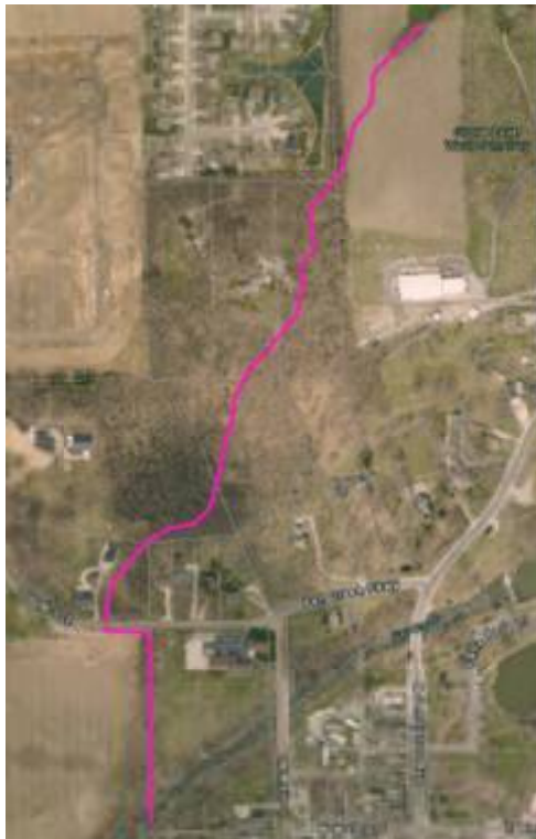
Figure 13 - Project A Location

Project A is the maintenance of an Unnamed Tributary to Fall Creek (see Figure 13). The tributary has had significant development within its watershed and erosion has started to occur. The project will provide for