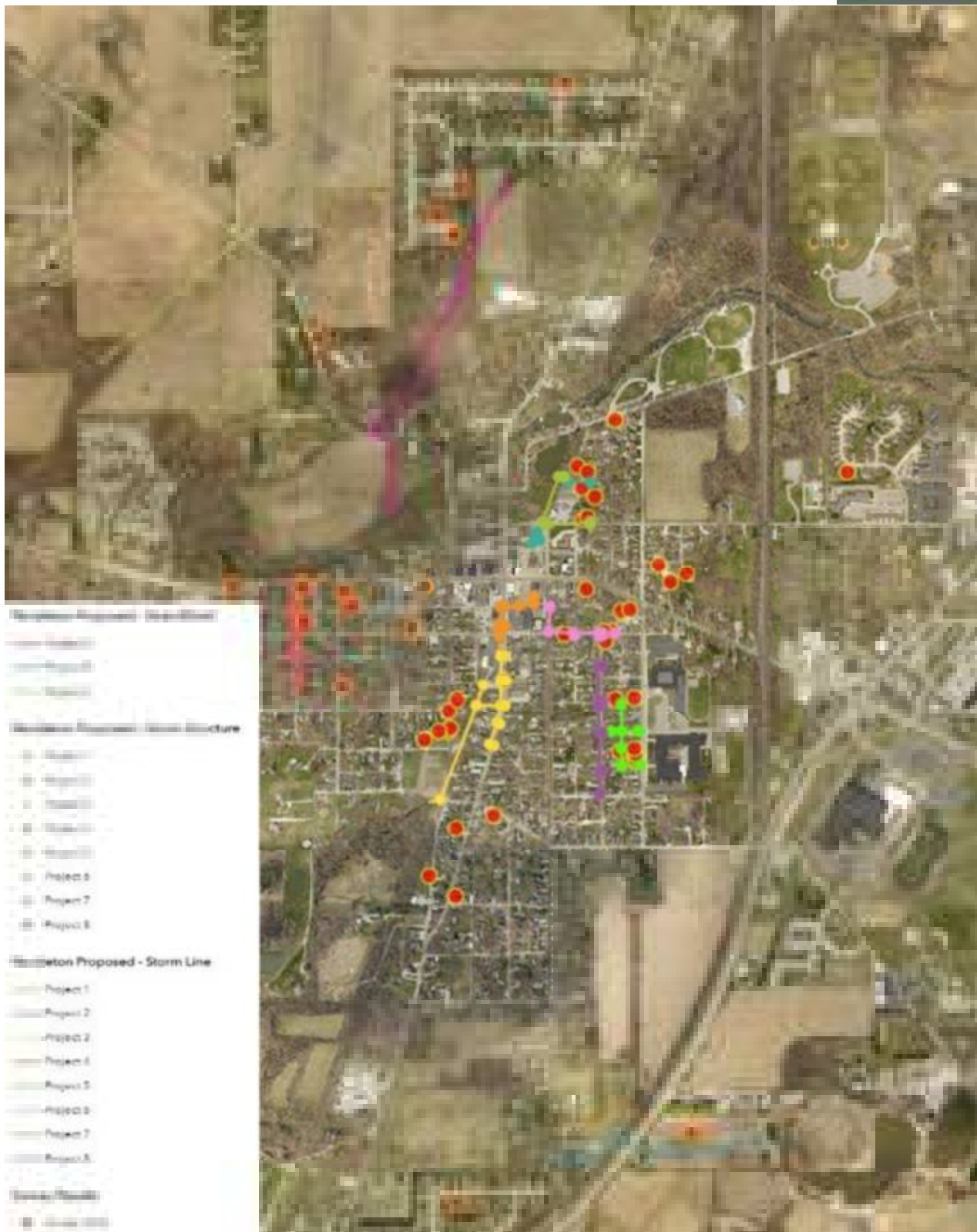
Figure 1 - Heat Map