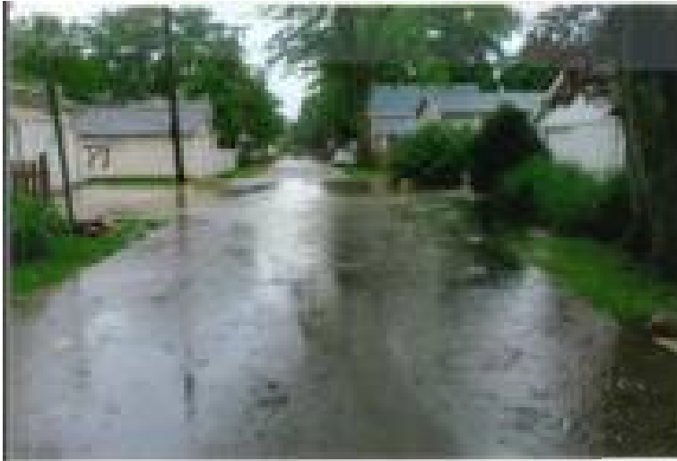
Figure 4 - Photo Submit by Resident of Flooding Near Elm and East St.

Flooding that was recorded to the west of Pendleton Elementary is focused in on Project Areas 5 & 8.