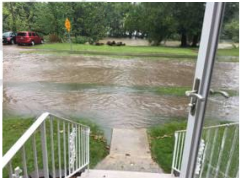
Figure 3 - Photo Submit by Resident of Flooding Near Adams and State St.

“The intersection of Adams St & W State St floods badly! We live on the corner and it floods halfway up our yard and deposits all kinds of detritus... The water reaches 1-2 ft in depth. VERY DANGEROUS!!”- Resident on State St.