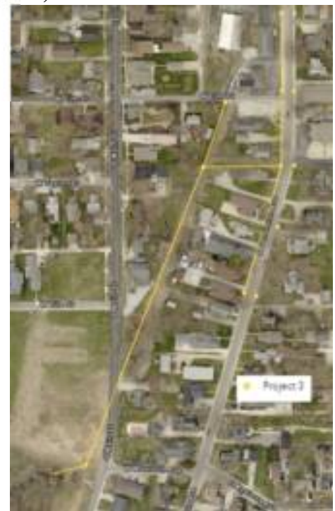
Figure 7 - Project 3 Location

Figure 7 shows the recommended improvements to this stormwater system. Pipes ranging from 12" to 30" need to be installed along with approximately 20 structures to adequately handle the flow. The preliminary cost estimation for the improvements is approximately $1,270,000 and includes budgetary numbers for engineering, a construction contingency and other associated non-construction costs