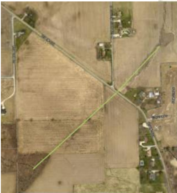
Figure 15 - Project C Location

Project C is the reconstruction of the lower ½ mile of the Rosa Frey regulated drain tile. As noted in Figure 16, the area floods frequently. With continuing development pressures from the east, the Rosa Frey Watershed will need reconstructed to appropriately handle stormwater runoff. The tile system is currently only sized for subsurface drainage and could not be an adequate outlet for a storm sewer system.