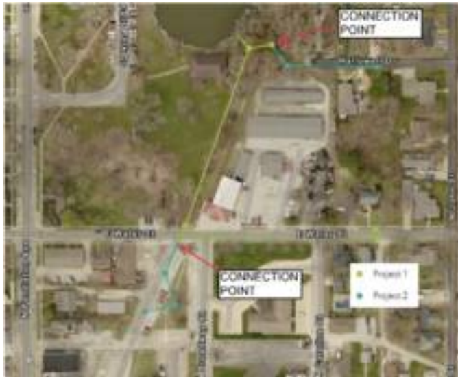
Figure 6 - Project 1 & 2 Location