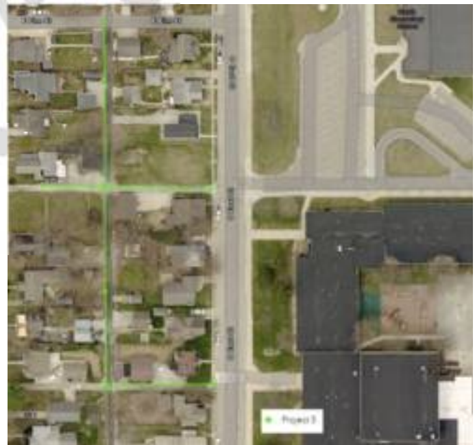
Figure 9 - Project 5 Location

It is recommended that storm lines ranging from 12" to 15" be installed along with approximately 7 storm structures. Figure 9 shows the proposed layout of those structures from East Elm Street down the alley until it connects with the existing storm lines that run on South East Street. The preliminary cost estimate for these improvements is approximately $460,000 and includes a construction contingency and budgetary numbers for engineering and other associated non-construction costs.