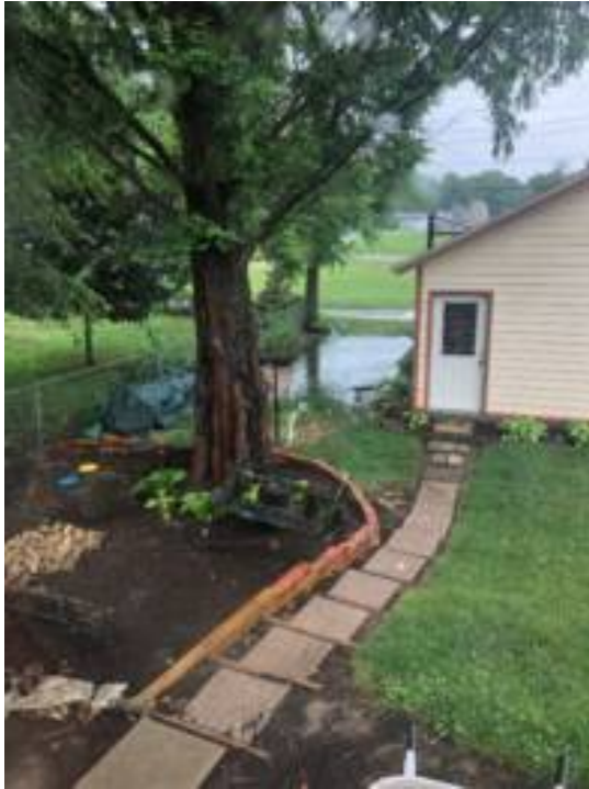
Figure 5 - Photo Submit by Resident Showing Flooding in Back Yard Near Project 9 Area

Project Area 9 also received several resident submissions and was selected as an area of future improvement.