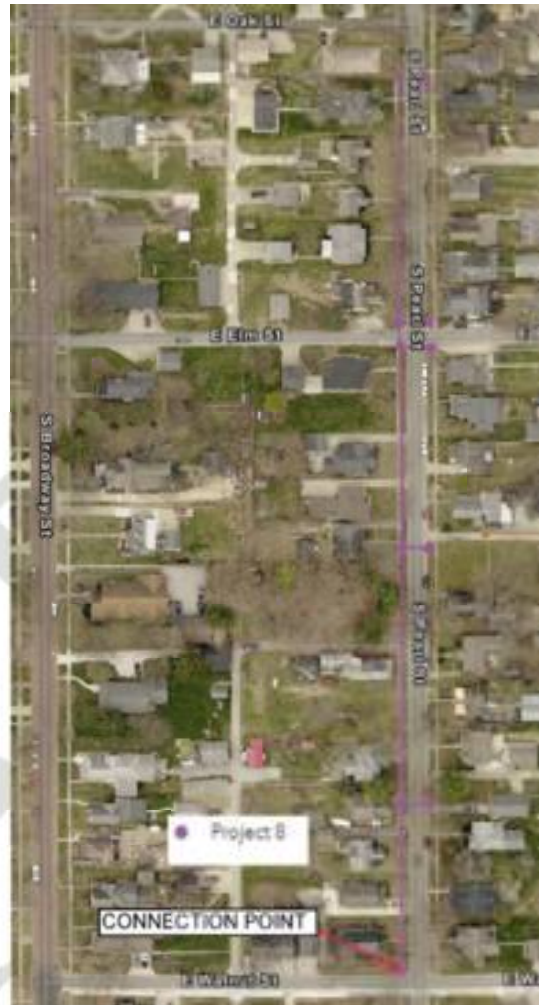
Figure 12 - Project 8 Location

Grade control structures and other erosion control measures will be installed in the middle 1,900 feet through a highly erodible wooded area. The upper 900 feet runs through Grove Lawn cemetery property. Currently the area is farmed with row crops. A grassed waterway will be installed to lesson erosion through the farmed ground. The preliminary cost estimate for these improvements is approximately $176,500 and includes a construction contingency and budgetary numbers for engineering and other associated non-construction costs.