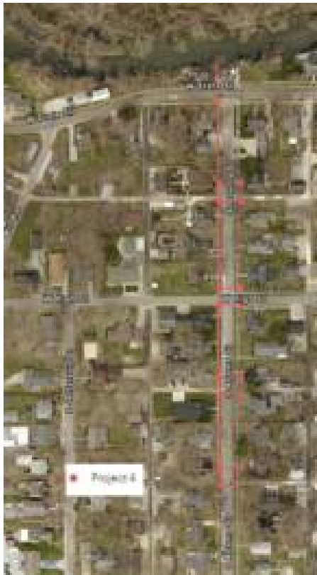
Figure 8 - Project 4 Location

Project Area 4 contains a 7.2-acre drainage basin. It is currently served by an undersized stormwater system. The area near the intersection of SR 38 and Adams Street floods frequently. The current placement of inlet structures and 16" pipe does not have adequate capacity. The entire drainage basin converges on this intersection as the runoff waits to be outlet into Fall Creek.