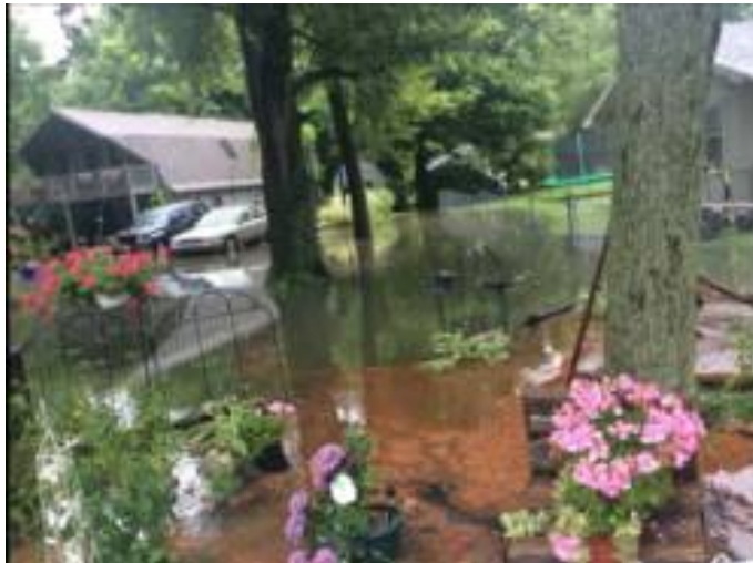
Figure 2– Photo Submit by Resident of Flooding on Hollowell Dr.

“My home and yard floods every time we have a heavy rain. Storm water comes rushing down from water street and crosses Hollowell Dr and runs onto my property.”- Resident on Hollowell Dr.