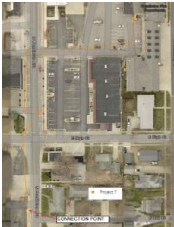
Figure 11 - Project 7 Location

Project Area 2 has been identified by the Town due to the parking lot behind the fire station accumulating up to a few feet of water during rain events. Reportedly this area takes significant time to drain once it gets filled. The current stormwater system consists of an 8" and 12" PVC storm line that collects stormwater from surrounding building roof drains and parking lots. These pipes do not have adequate capacity to handle the flow to them.