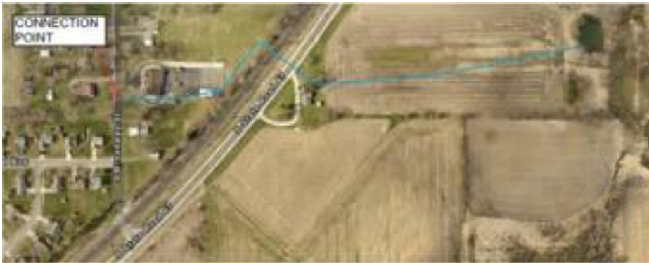
Figure 14 - Project B Location

The current estimated cost opinion for Project B is $446,250. This estimate includes engineering fees and construction contingency. Complicating this project is a jack and bore storm pipe requirement under U.S. 36 and the CSX railroad. Several utilities are likely in conflict with a proposed reconstruction. The project could also serve as a storm sewer outlet for a future improvement to Broadway Street near U.S. 36.