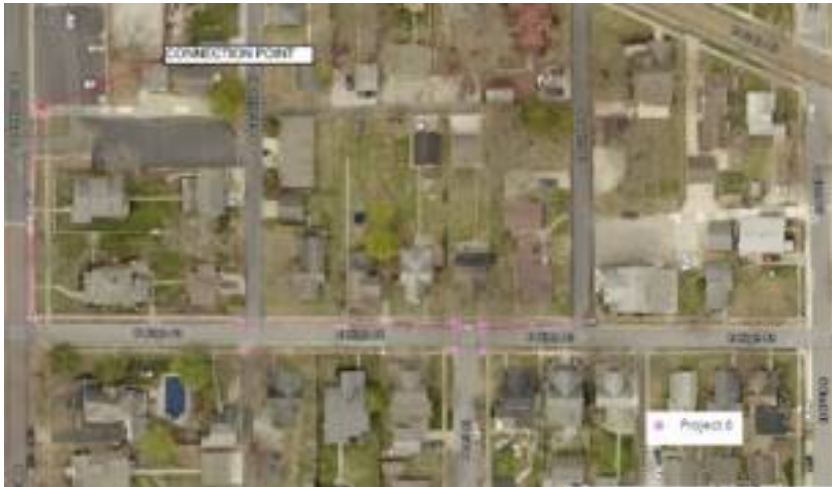
Figure 10 - Project 6 Location

Project 6 will address an area on East High Street between Pendleton Avenue and East Street that has reported flooding. The existing storm structure system around this area cannot adequately service the amount of flow that is estimated for this basin area.